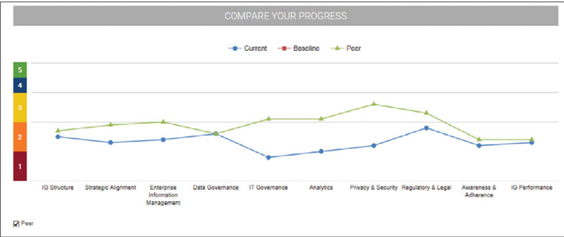
EXHIBIT 4: IGHEALTHRATE™ WILL PROVIDE A PEER COMPARISON AGAINST EACH IG COMPETENCY

IGHealthRate™ provides a comparison of your organization's IG rating against peers in your region for each competency. Intended to help your organization understand where gaps exist in comparison to your peers. Your IG Advisor will leverage this input to inform your organization as well source key recommendations in the IG implementation plan and roadmap.