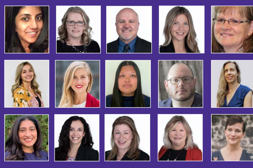
National team members